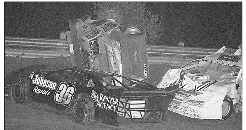
A change reaction resulted in Nick Opfer (34) flipping onto his side, last week. Each driver walked away.