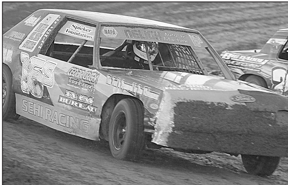
MD Sehi (16) finished just outside the top 5 at the sixth position.