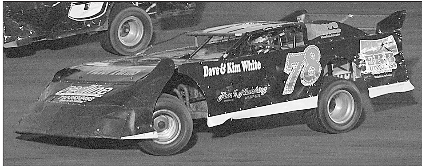
Travis Birkley (78) picked up his second feature win and jumped to second in the point standings.