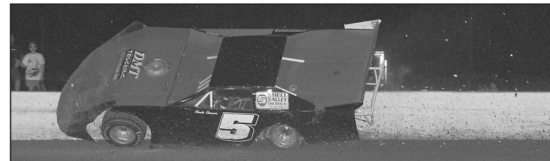
Heath Clausen (5) jumps the wall and almost exited the track during the "A" feature last week.