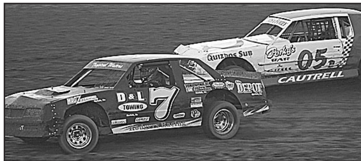
Jared Rodgers (7) battles with Nick Cautrell (05).