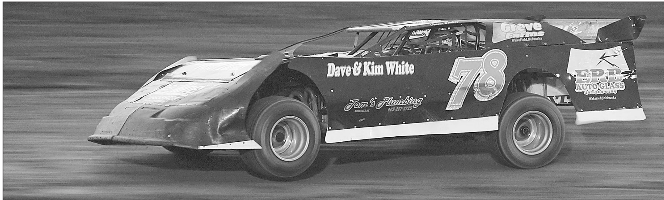
Travis Birkley picked up his first Grand National "A" feature win at the track last week.