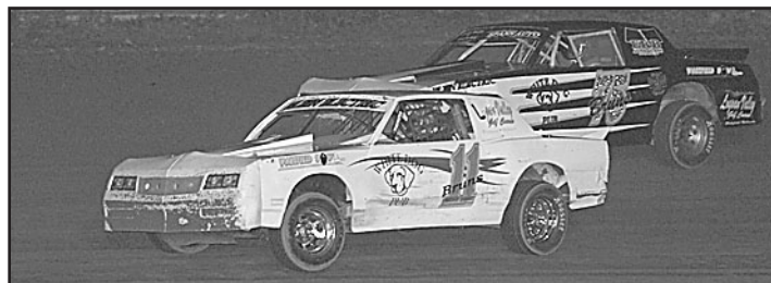
The Bruns brothers each tallied another top 5 finish.