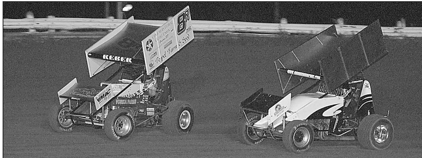
Brant Obanion (47) makes an attempt to pass Gary Reber (8) for the lead during the feature. Reber took the win and Obanion fell to fourth after pulling from the track.