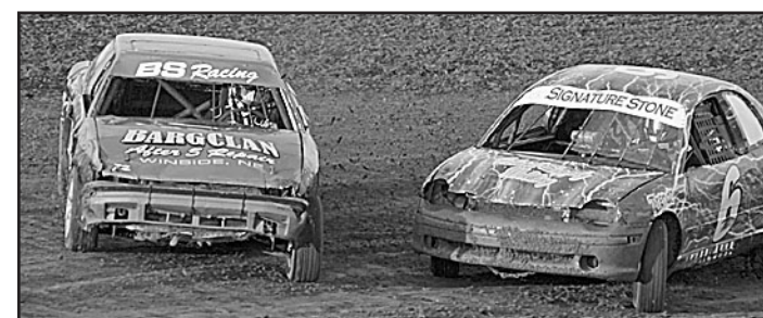
Kandie Smidt (2) leads Wyatt Lehman (6) in their heat race.