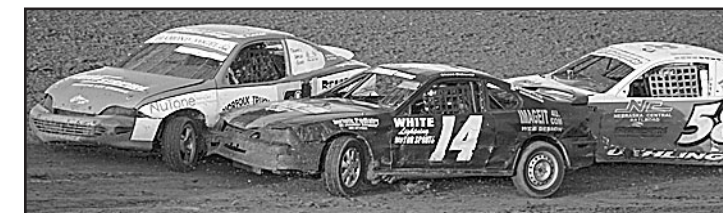
Chase Osborne (14) pushes up the track in his heat race. Later he finished third in the feature.