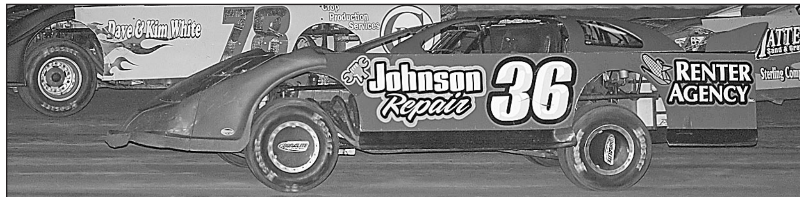
This is the cut line type for the words under the pictures. Now I need to check and see something.