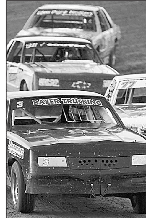
Chase Arduser (3) leads a group out of the corner in their heat race.