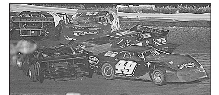
On the first lap of the feature, one driver lost control and shot up the track in front of most the field causing a pile up of cars.