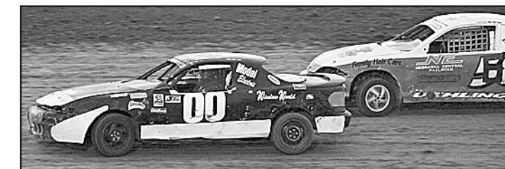
Shannon Pospisil (00) and JD Dunklau (85) run during their heat race. Dunklau finished second in the feature later, as Pospisil placed fifth.