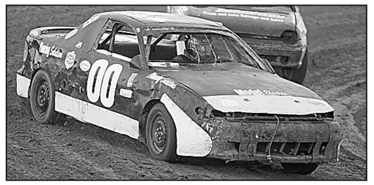
Shannon Pospisil (00) finished fourth in the feature.