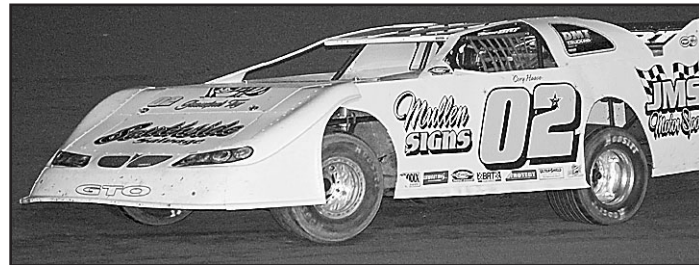
Cory Haase (02) took a second place finish in the first feature of the night.