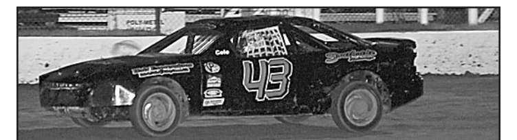
Cole Wiley (43) takes the checkered flag for the second week in a row.