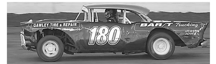
Corey Campbell (180) took fourth in the feature.