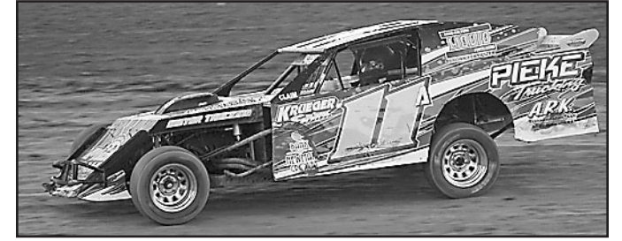
Tyler Afrank (11A) took a top 5 finish in the feature.