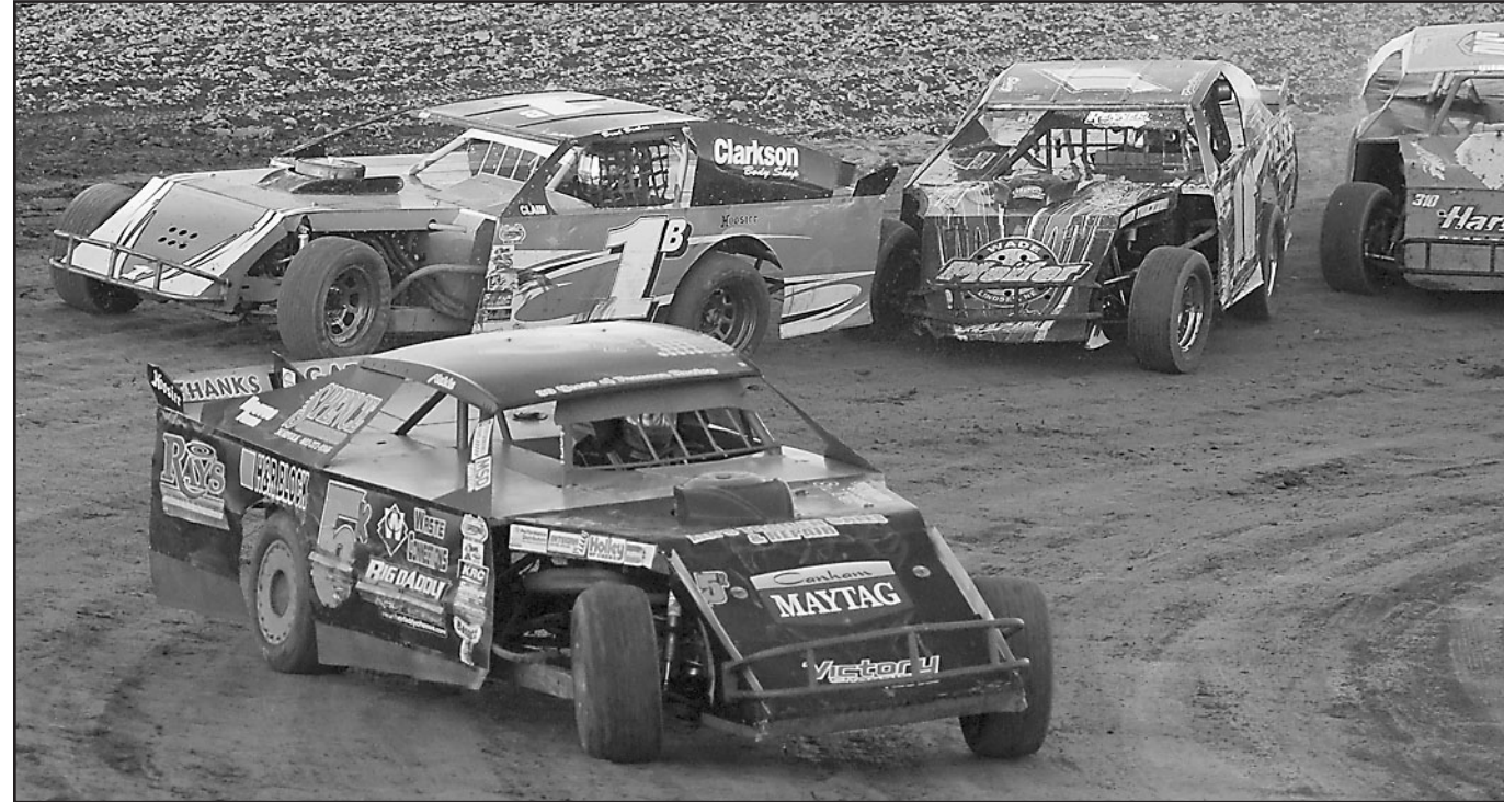
Kyle Prauner (5K) took another feature win last week as he stayed out of front.