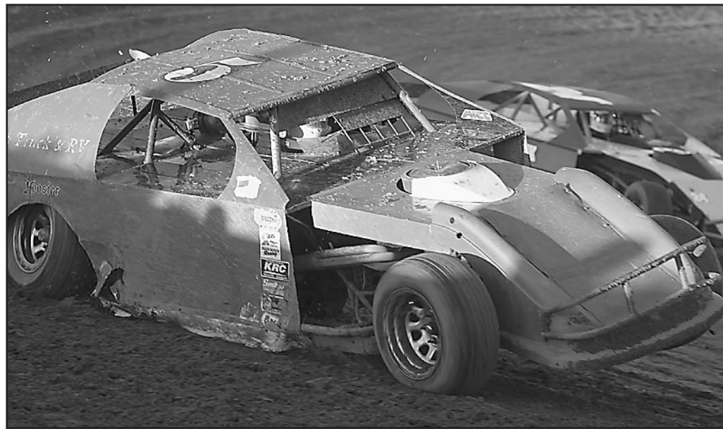
Ken Eckhoff (5) lost a right rear shock tried to get through the corner.