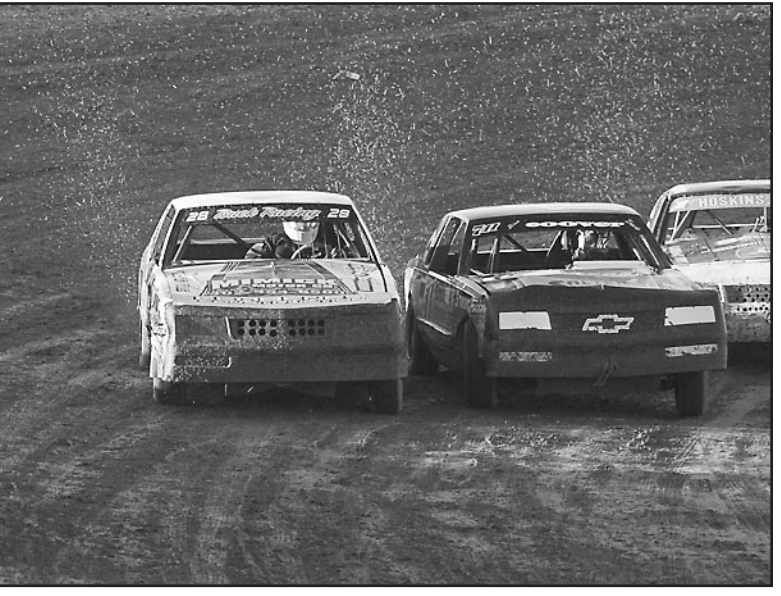
Jake Timm leads a group out four in his heat race. Timm finished third in the feature after leading three laps.