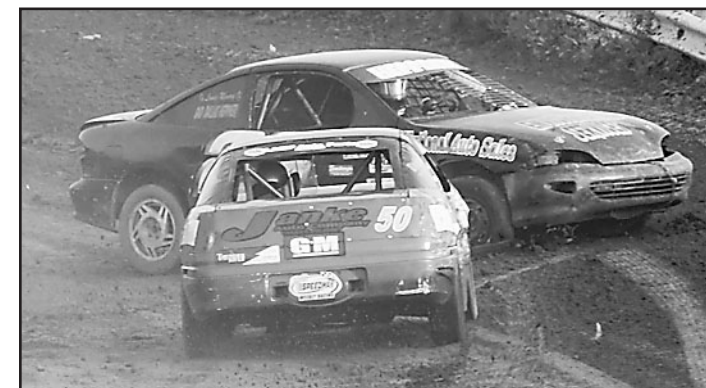
Kevin Heppner (29) spins up the track after he got mixed up in other cars tangling in their heat race.