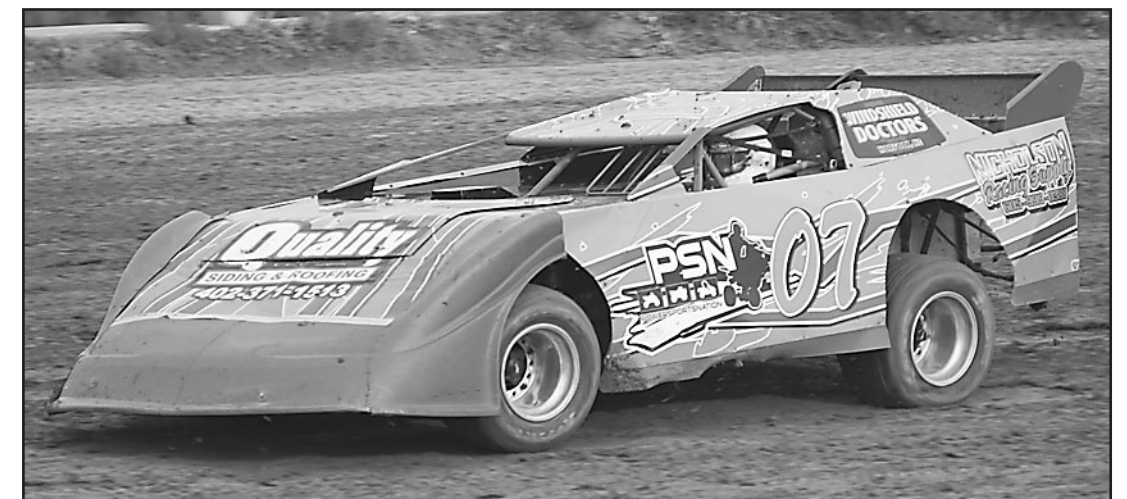
Ben Sukup (07) returned to the track and finished second in the feature.