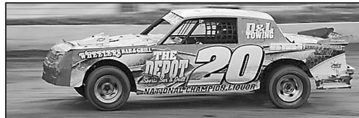
Eric Haase (20) finished sixth in both the feature and heat race.