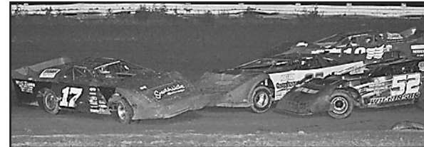
BJ Haase (17) gets turned around after making contact with another vehicle during the feature, as other cars pileup and avoid hitting him.