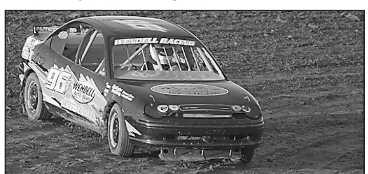
Tori Wendell (96t) took a third place in the feature.