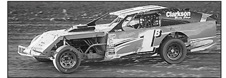
Brad Brabec captured a fifth place finish.