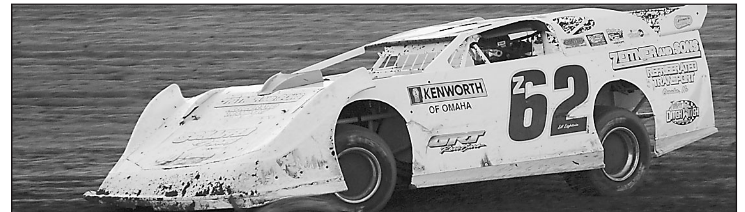
Corey Zeitner (z62) led 14 laps before a caution erased a lead he had built up. He finished second.