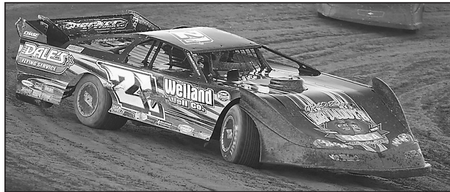
Madison driver Travis Dickes (21t) placed fourth in the main event.