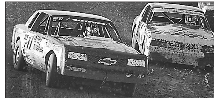
Travis Coover (7-11) leads Marty Steinbech (5) out of turn four. Coover finished second in the feature and Steinbech was third.