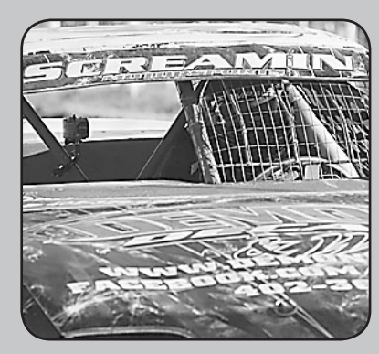
Jordan Uehling Sports Compact