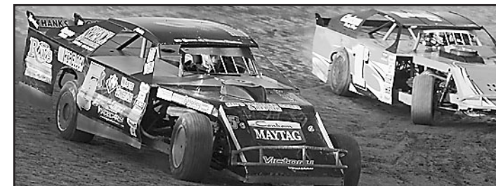
Kyle Prauner (5k) finished second in the feature, as Brad Brabec (1B) was moving up in the feature before he lost a rear spring.