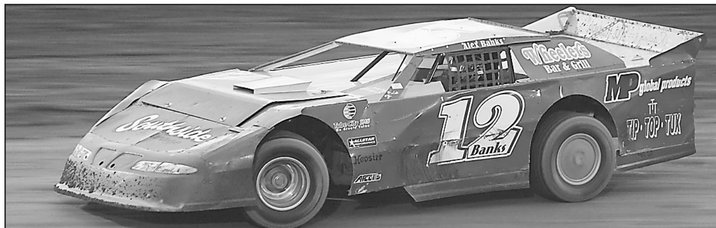
Alex Banks (12) took a heat race win and later finished sixth in the feature.