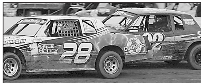
Tracy Buck led four laps in the feature, as Tom Marksmeier (92) finished fifth in the main event.