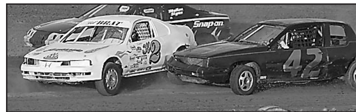
Chris Brummels (42) pushes going into turn three and tangles with Kandie Smidt (2).