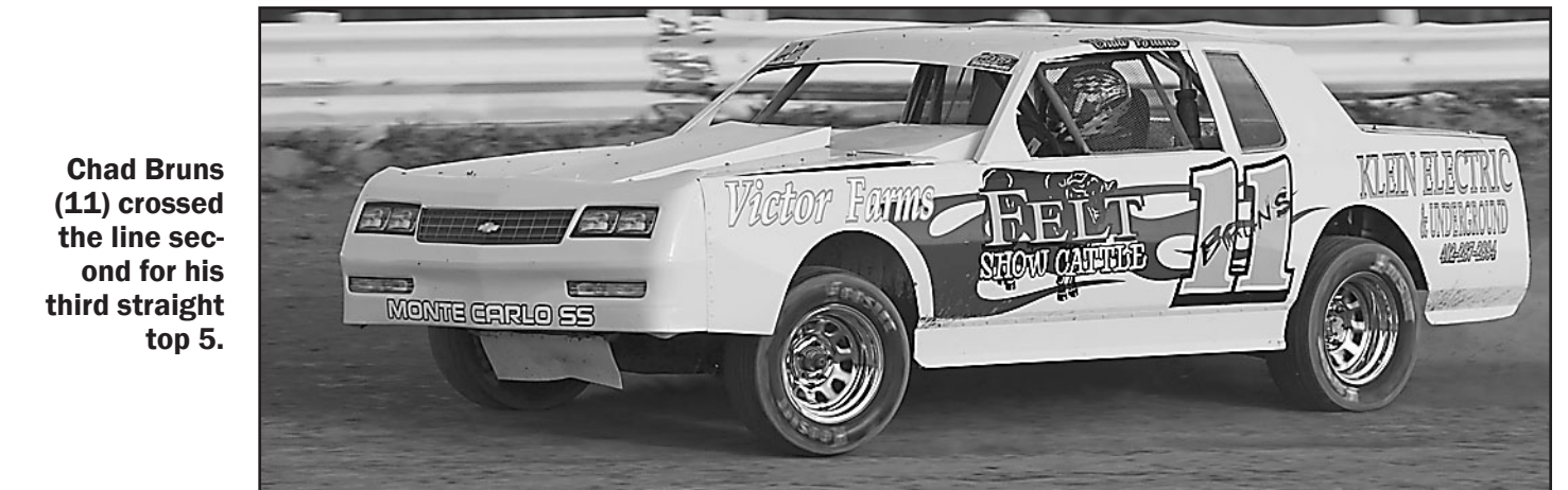
Chad Bruns (11) crossed the line second for his third straight top 5.