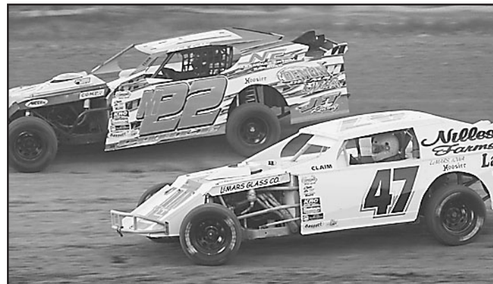
Darin Roepke (47) races inside Mitch Coble (M22) during the heat race. Roepke finished fifth in the feature.