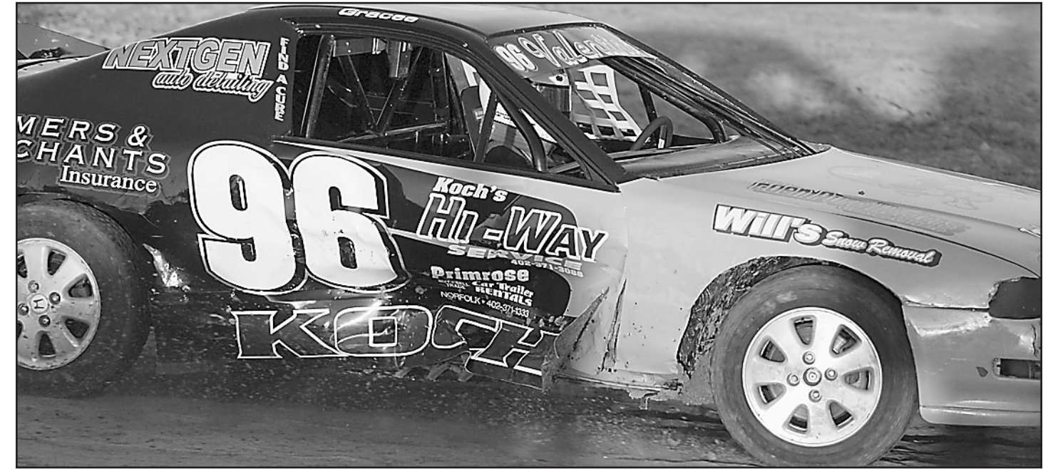
Gage Koch (96) got himself a ding in the heat race and later duke it out for the win in the feature.