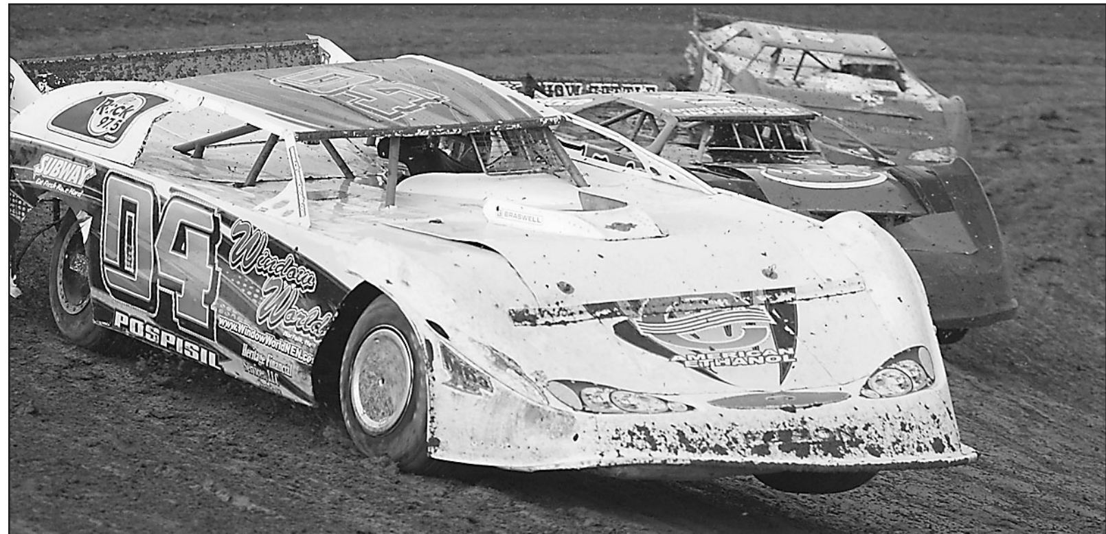
Tad Pospisil (04) led the final two laps to win the "A" feature, last week.