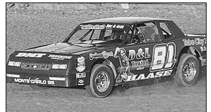
Defending points champion took a third place finish in the feature.