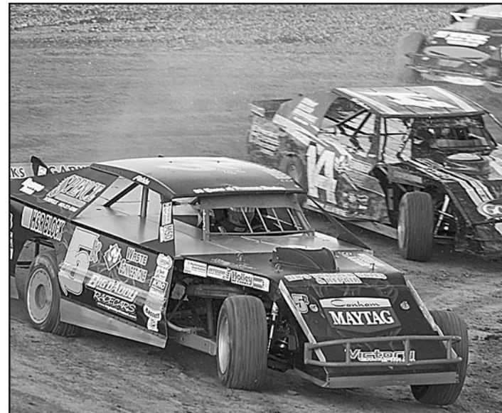
Kyle Prauner (5) won his heat race, but finished second in the feature.