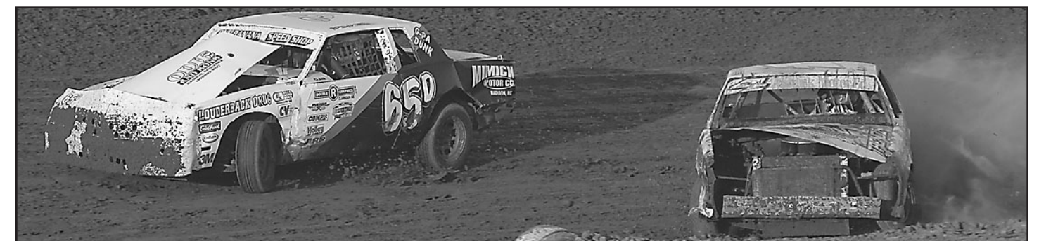
Jeb Dunklau (65D) and Kaleb Jasperson (4x) suffered damage in their heat race.