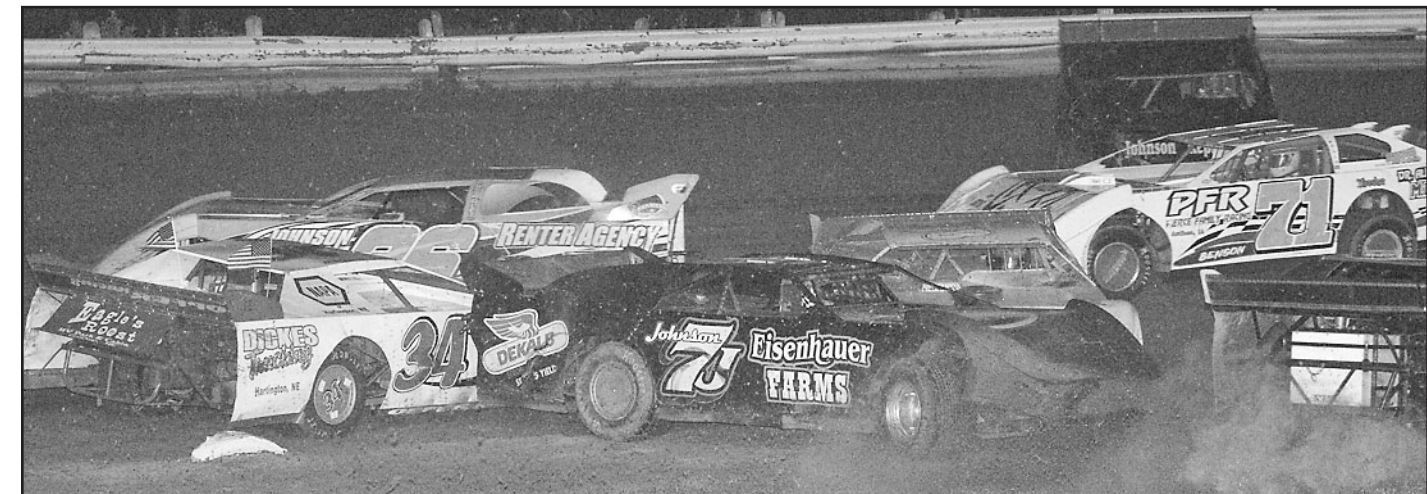
Cars stack up after a pile up in front of them.