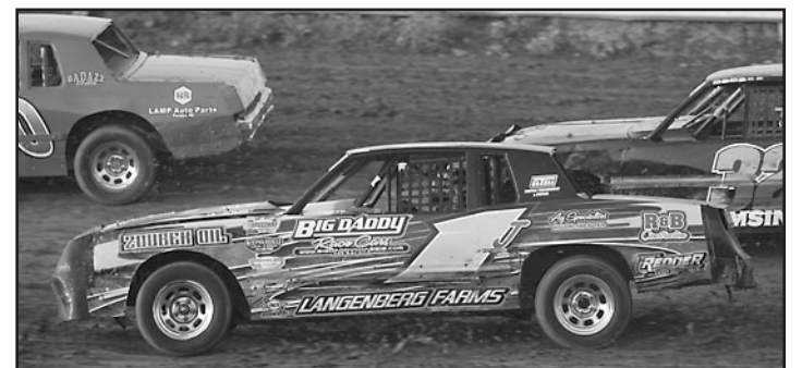
Colby Langenberg (1J) finished second in the feature.