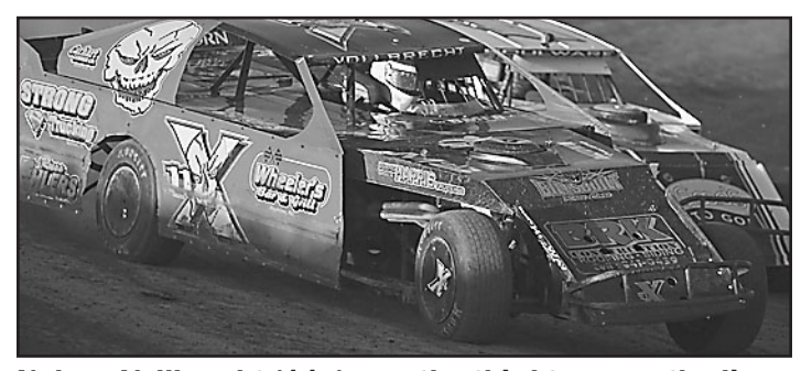
Nelson Vollbrecht (11x) was the third to cross the line.