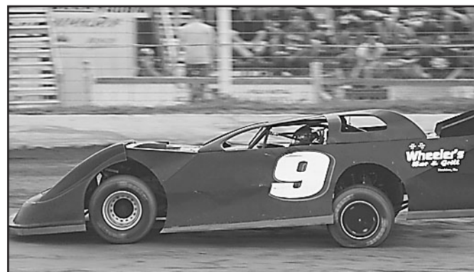
Eric Vansodall (9) rounded out the top 5. His second top 5 of the season.