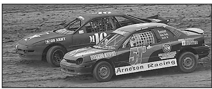
Bristol Arneson (51B) runs inside of Miles Reopke (m16) in their heat race.