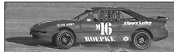
Miles Reopke (m16) took second in the feature.