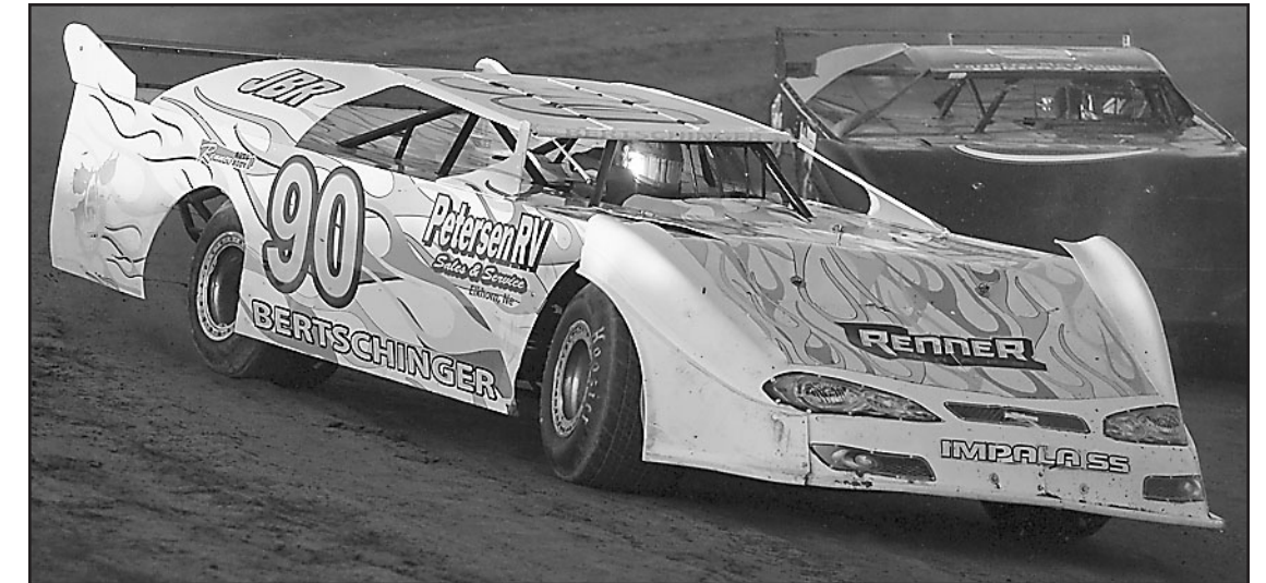
Justin Bertschinger (90) finished second in the feature.