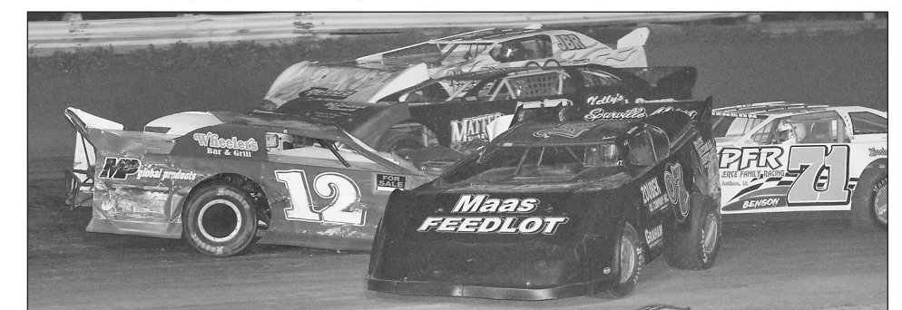
A slick dry track was too much, as cars stacked up on the first lap.