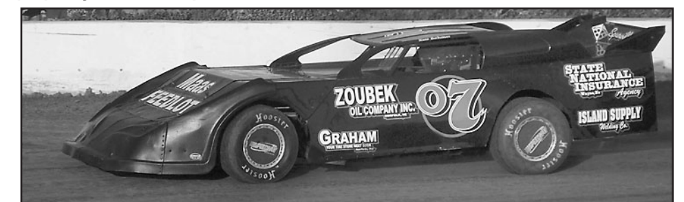
Nate Behmer (07) led four laps in the feature.