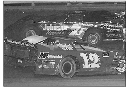
Cars got stacked up at the start of the feature race, last week, which backed up the cars behind.