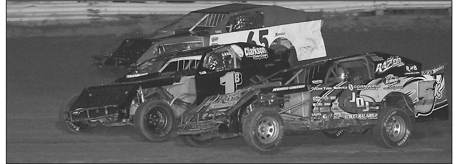
Kyle Prauner (5K) runs inside Brad Brabec (1B) and Chad Bruns (65) in the feature.