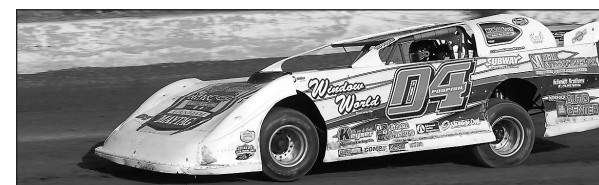
Tad Pospisil (04) took a fourth place finish.