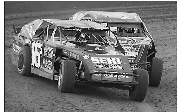
Derek Sehi (16s) leads Kyle Prauner (5K) out of turn four in their heat race.