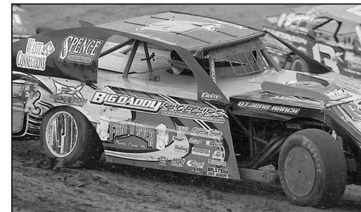
Kyle Prauner (5K) runs his heat race and later placed fourth in the feature.