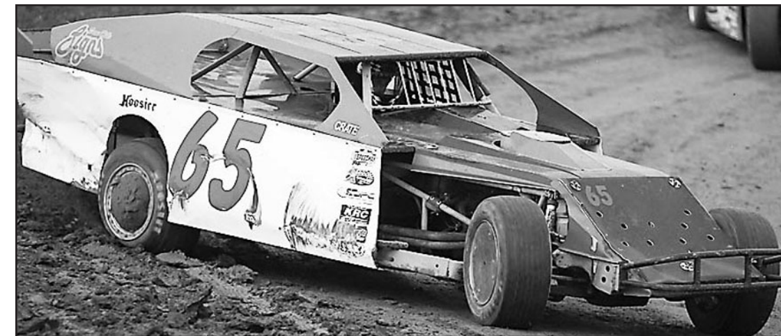
Chad Bruns (65) won his heat race and later finished third in the feature after leading the race.