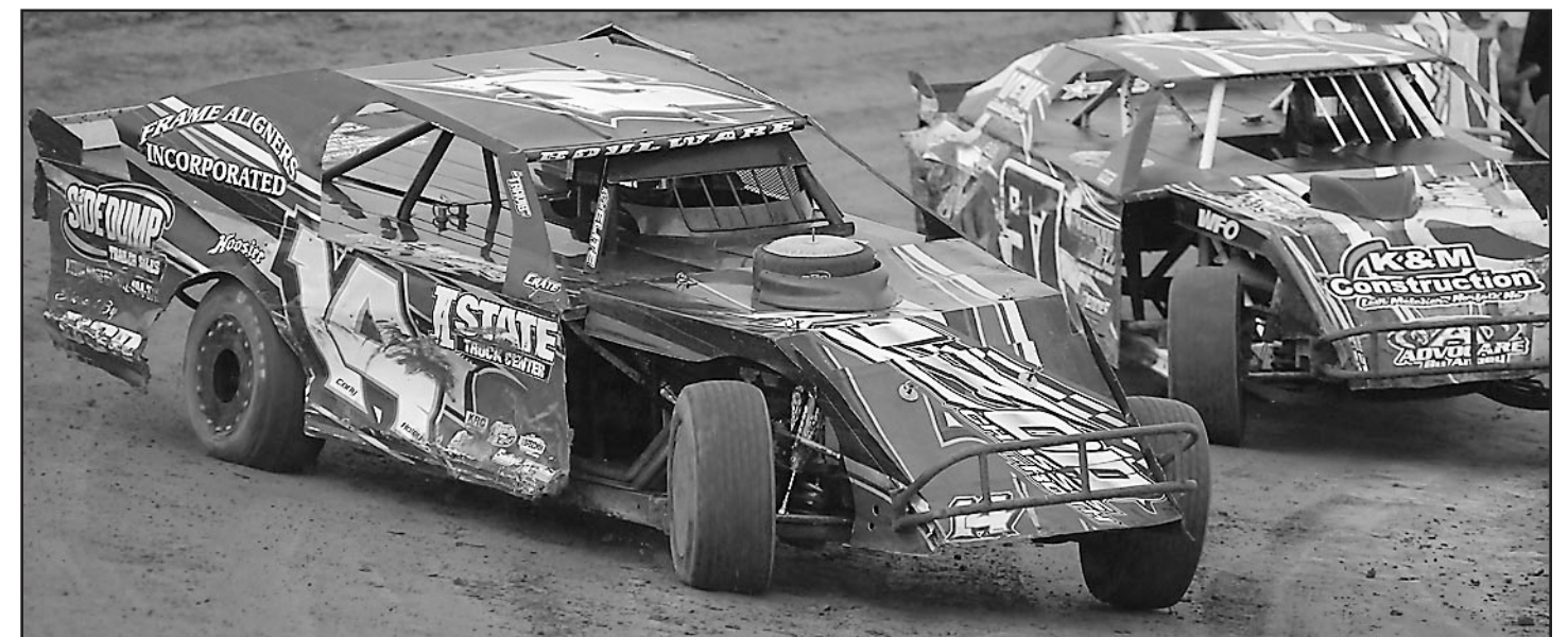
Todd Boulware took his fourth top 5 finish last week when he finished second in the main event.