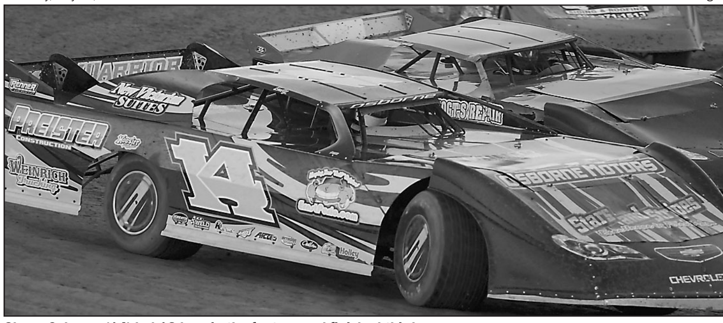
Chase Osborne (14) led 18 laps in the feature and finished third.