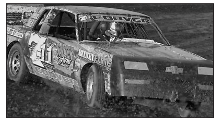
Travis Coover (7-11) took his second top 5 finish when he finished third in the feature.