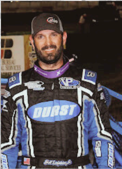
Bill Leighton Super Late Models