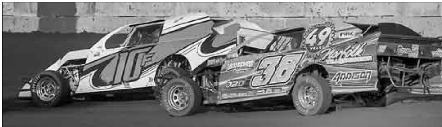
Aaron French (10F) and Jeremy Gnat (38) race into turn three during their heat race. French later finished fourth in the feature.