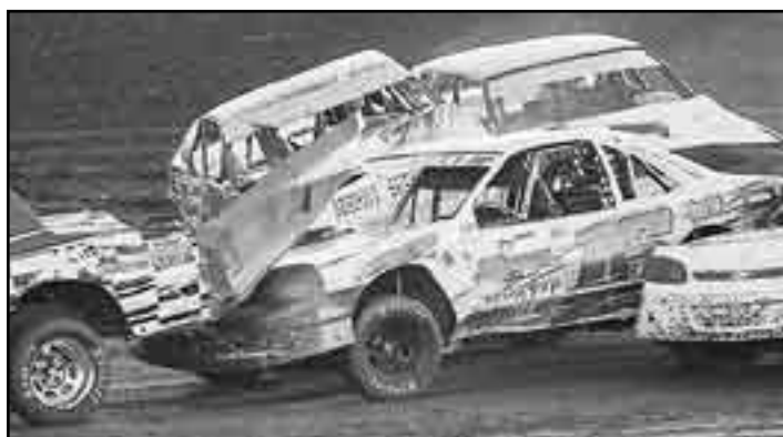
Tanner Cunningham (55) nearly flips after cars stack up in their heat race.