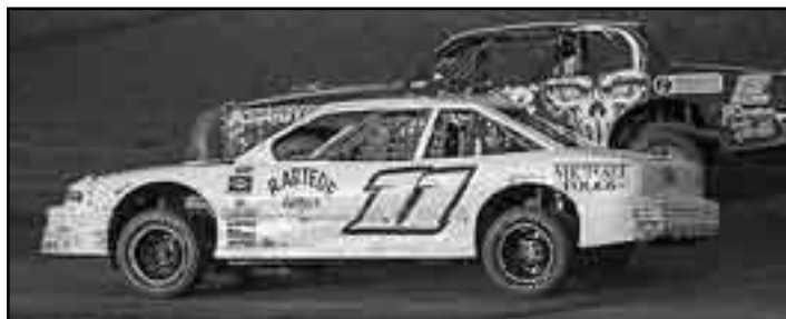
Chad Bruns (11) finished fourth in the feature.