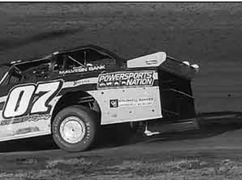
son took fifth.