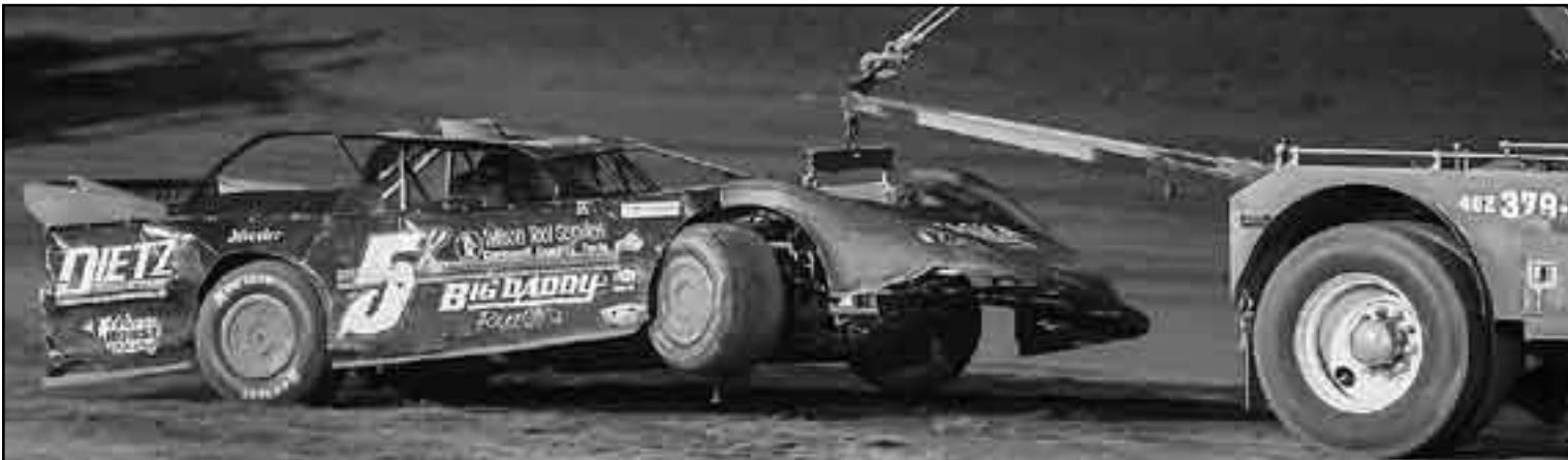
Kyle Prauner (5K) leaves the track on the hook. Prauner's points lead drops to 10 over Chase Osborne.