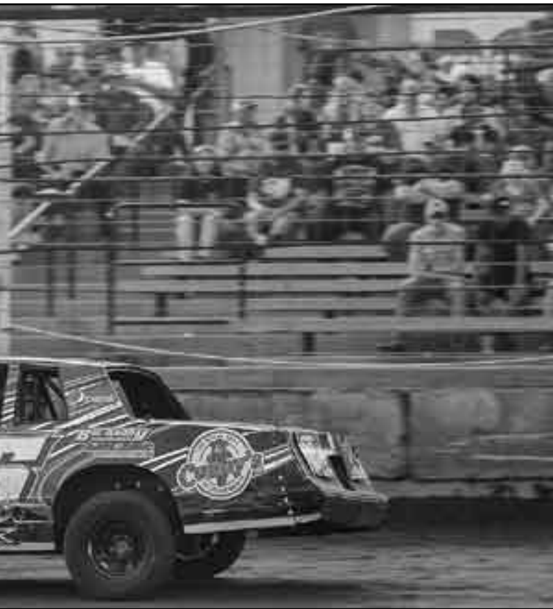
Look the checkered flag first in the feature.