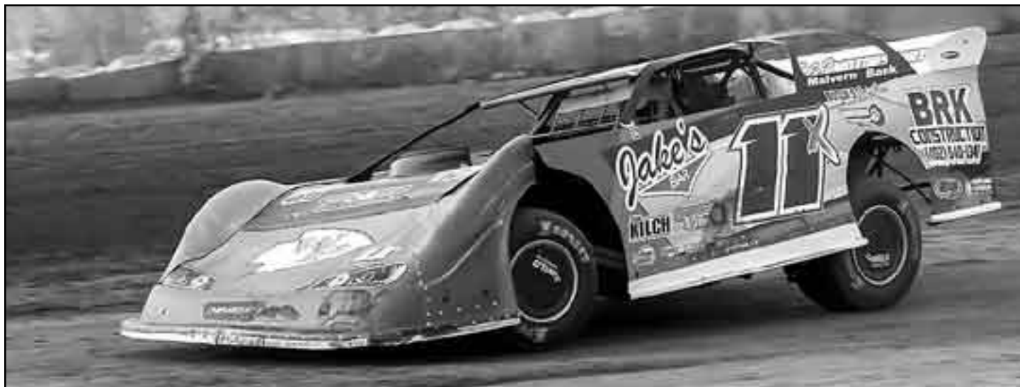
Nelson Vollbrecht (11x) led nine laps before finishing fourth in the main event.