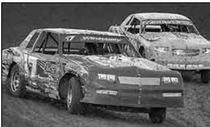
Nic Kimmel (K17) had his fifth top 5 placing fourth in the feature.