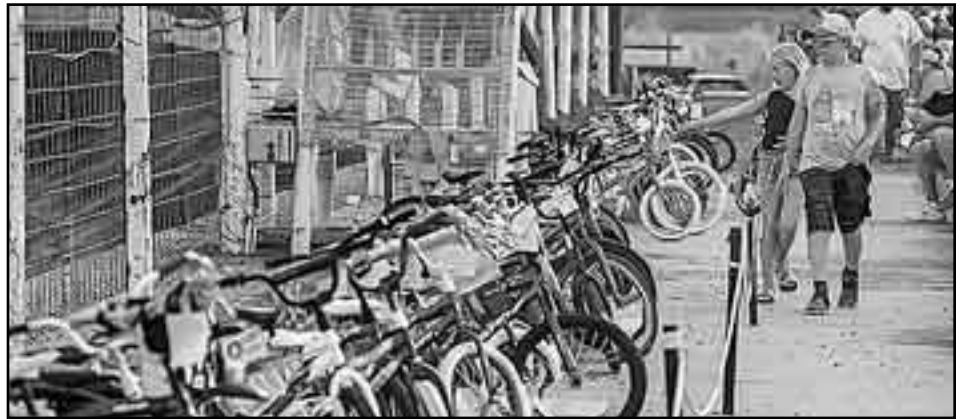
Nearly 50 bikes were donated by drivers and others during the bike giveaway last week.