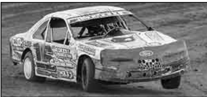
Derek Sehi (16s) finished fourth in the feature.