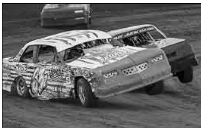
Allen Zimmerman (83z) pulls out of turn four