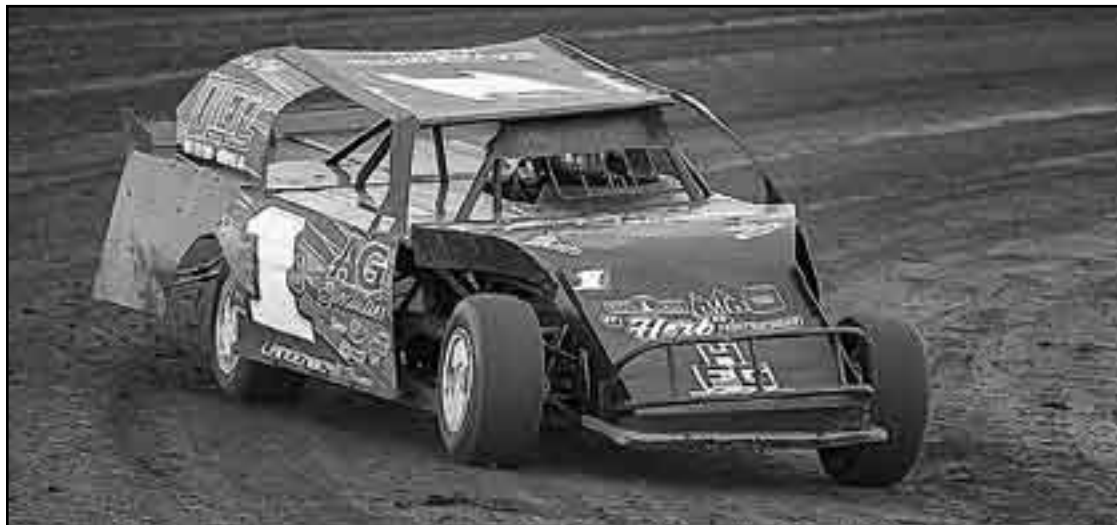
Colby Langenberg (11) finished second after leading 14 laps in the feature.