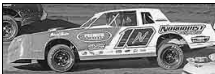
Kole Nordquist (10N) finished third in the feature.