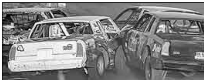
Four cars stack up in the first of three heat races.