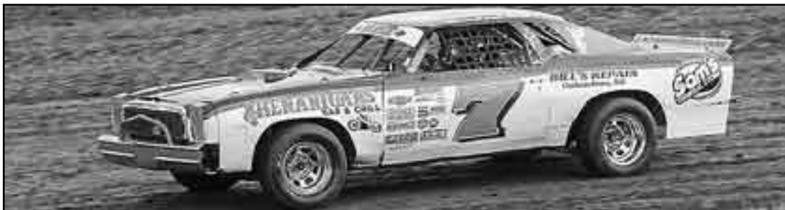
Bill Rombach (7) took third in the feature.