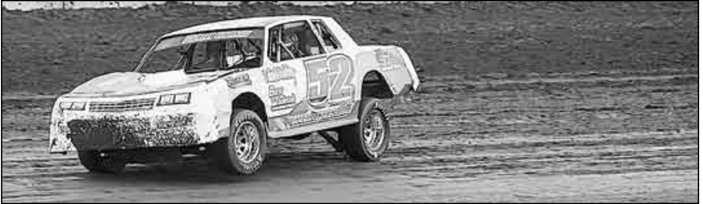
Kyle Wilkinson (52) posted his second straight feature win.