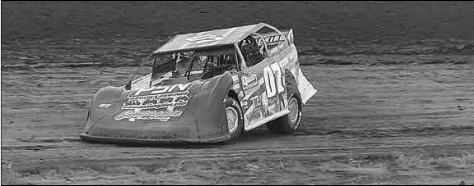
Ben Sukup (07) led 14 laps in the feature to pick up his first win of the season.