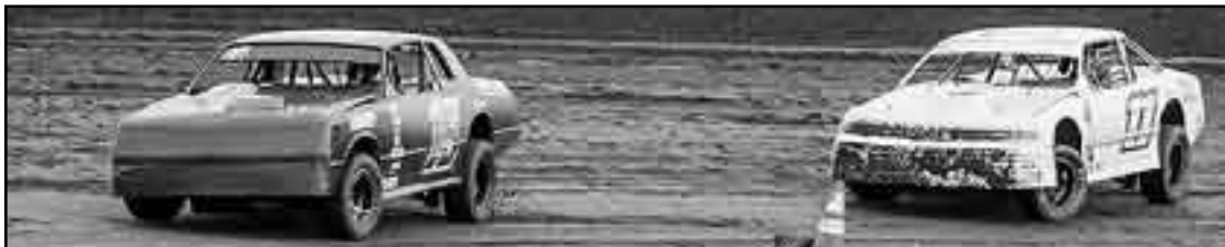
Jaycee Bruns (15) and Chad Bruns (11) race in their heat race. Jaycee Bruns led a lap in the feature before finishing ninth.