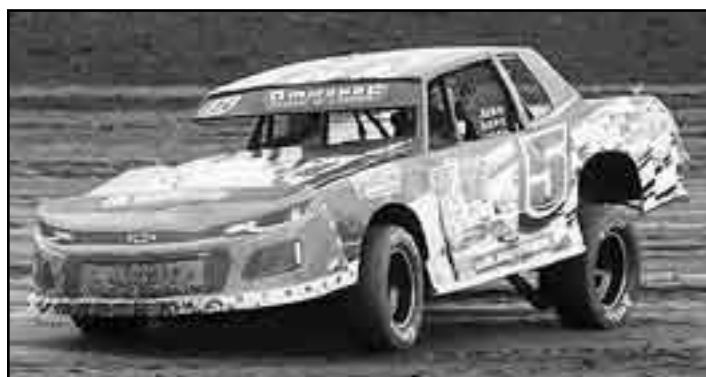
Cameron Wilkinson (5) finished third in the feature.