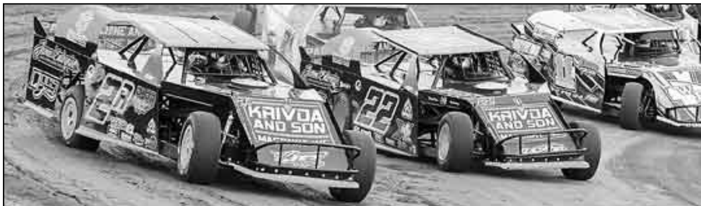
Rusty Glosser (2R) and Tim Swartz (22) exit turn four in their heat race. Swartz took his second top 5, placing fifth in the feature.