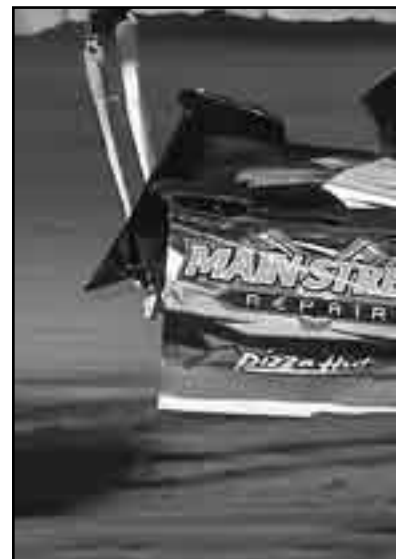
Terry Kester's (26m) stock car