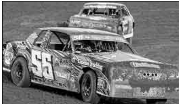
Nate Buck (56) and Shannon Pospisil (00) race in their heat race. Buck finished second in the feature, as Pospisil placed fourth.