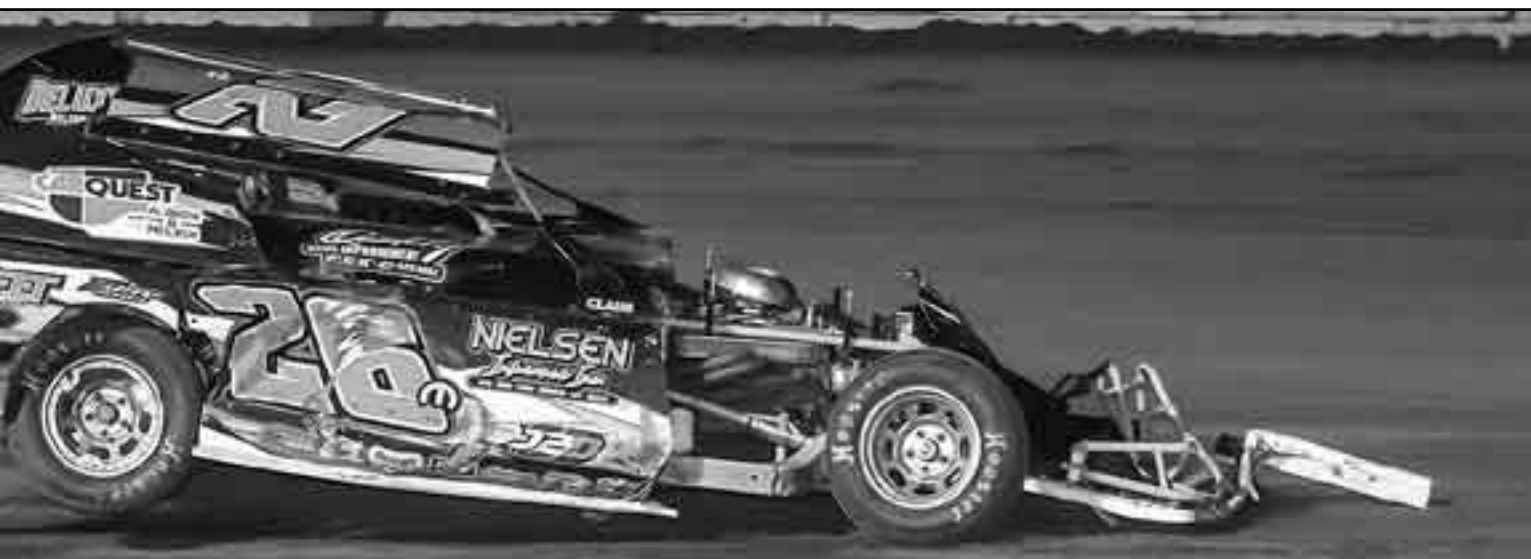
is pulled from the track after he rolled during the feature.