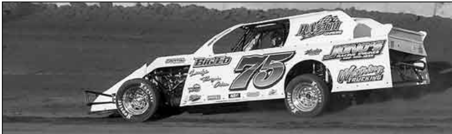
James Roebuck (75) led the final two laps of the 20-lap feature to pick up the first win of the season.