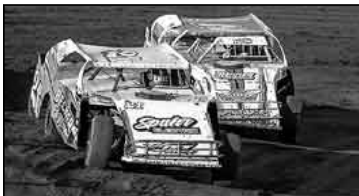
Wes Hochstein (21B) leads Joey Haase (2) in their heat race.