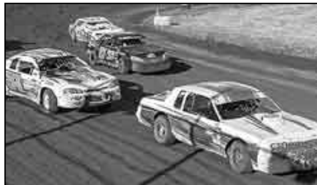
Cameron Wilkinson (5) leads a group to the finish of their heat. Wilkinson placed second in the feature.