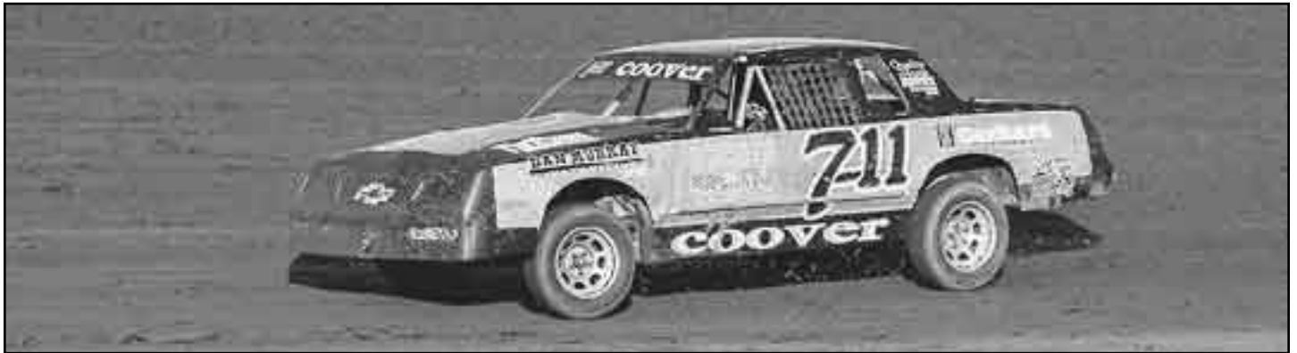
Travis Coover (711) picked up his first feature win at the track.