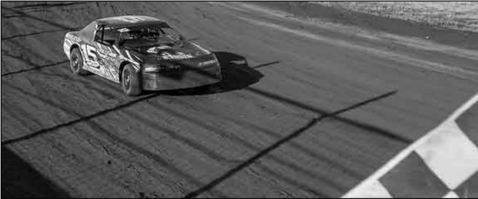
Chad Bruns (15) took the checkered flag first in the feature last week.