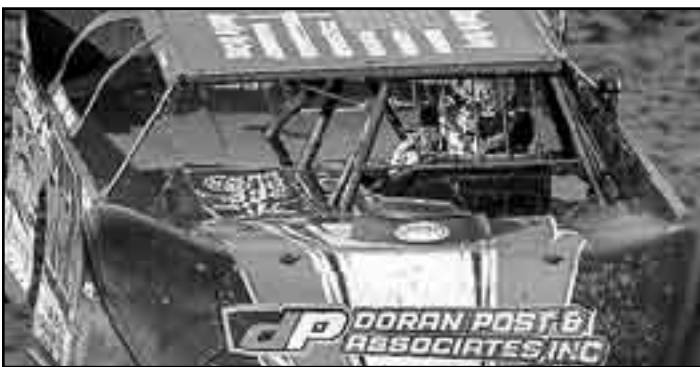
Cory Dumpert (77) took third in the feature.