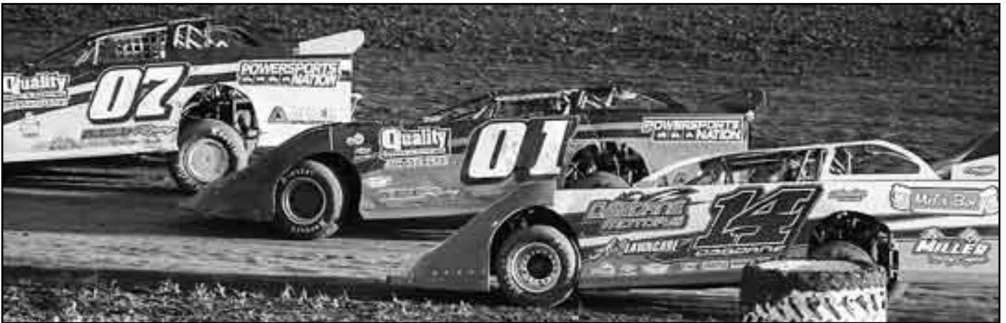
Chase Osborne (14) runs with Junior Coover (01) and Ben Sukup (07). Osborne finished second in the feature.