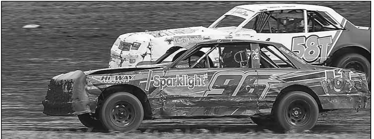
Gage Koch (96) races with Tanner Uehling (58T) in their heat race. Koch placed second in the feature.