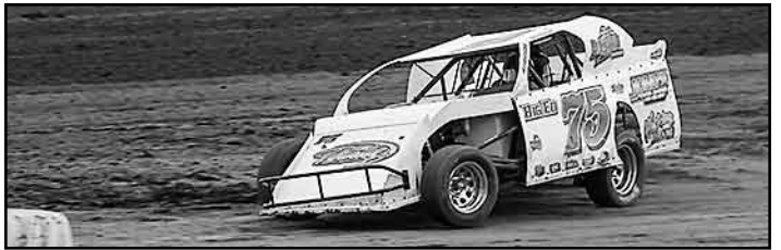
James Roebuck (75) won his heat race and later led 14 laps in the feature before dropping out of the race.