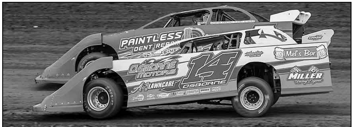
Chase Osborne (14) races inside of Kaleb Jaspersen (4) in their heat race. Osborne finished fifth in the feature.