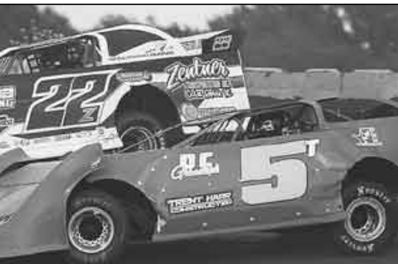
the outside of Tracy Harr (5t) in their heat race. Zentner later finished leading 12 laps.