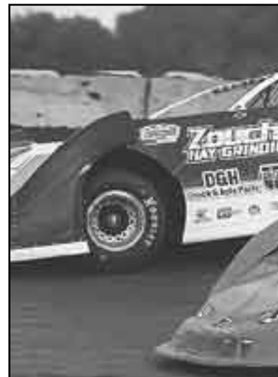
Zach Zentner (22z) races on the high side of the track and finished second in the feature after the restart.