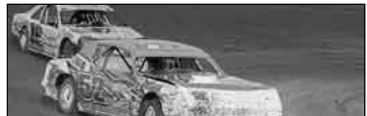
Kyle Wilkinson (52) leads Derek Sehi (16s) out turn four in their heat race.