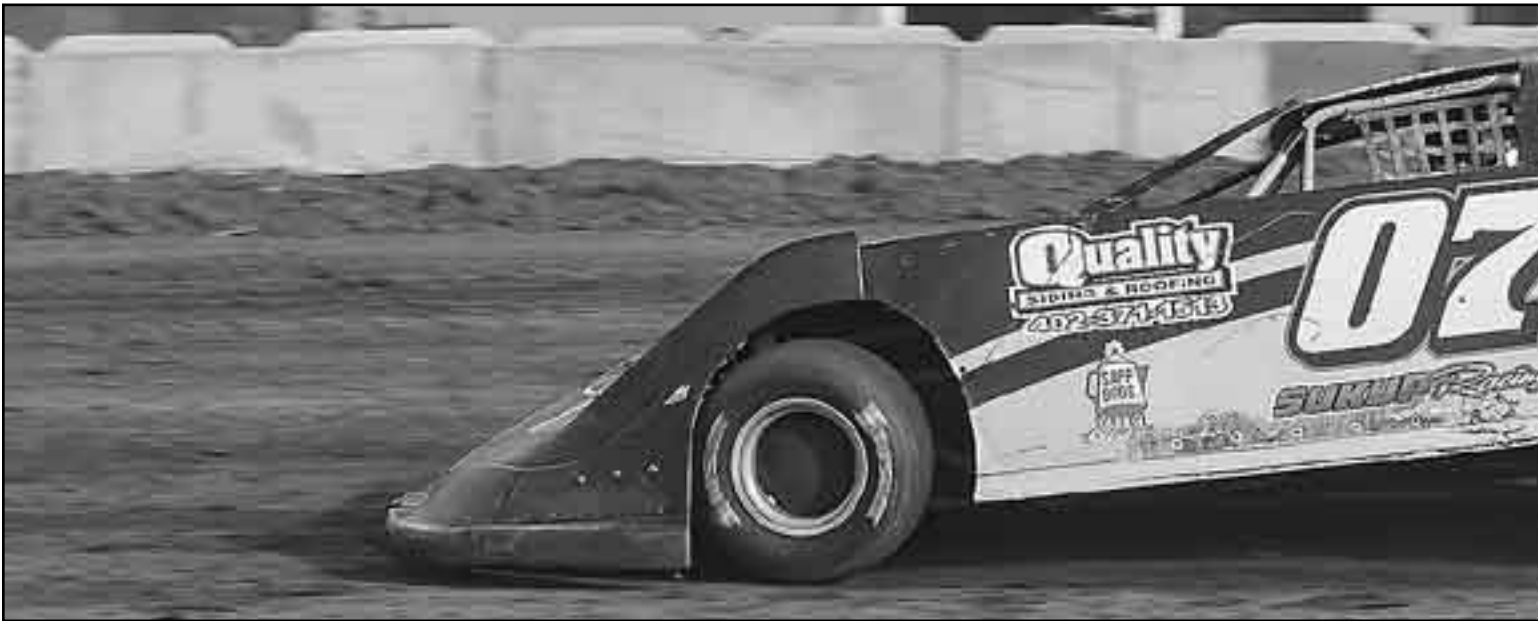
Ben Sukup (07) led 13 laps to win the feature, last week.