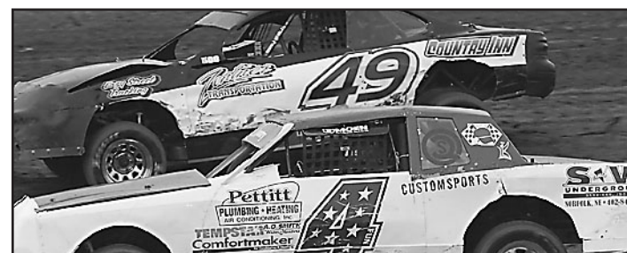
Dale Primrose (4) and Zach Zentner (49) race in their heat race.