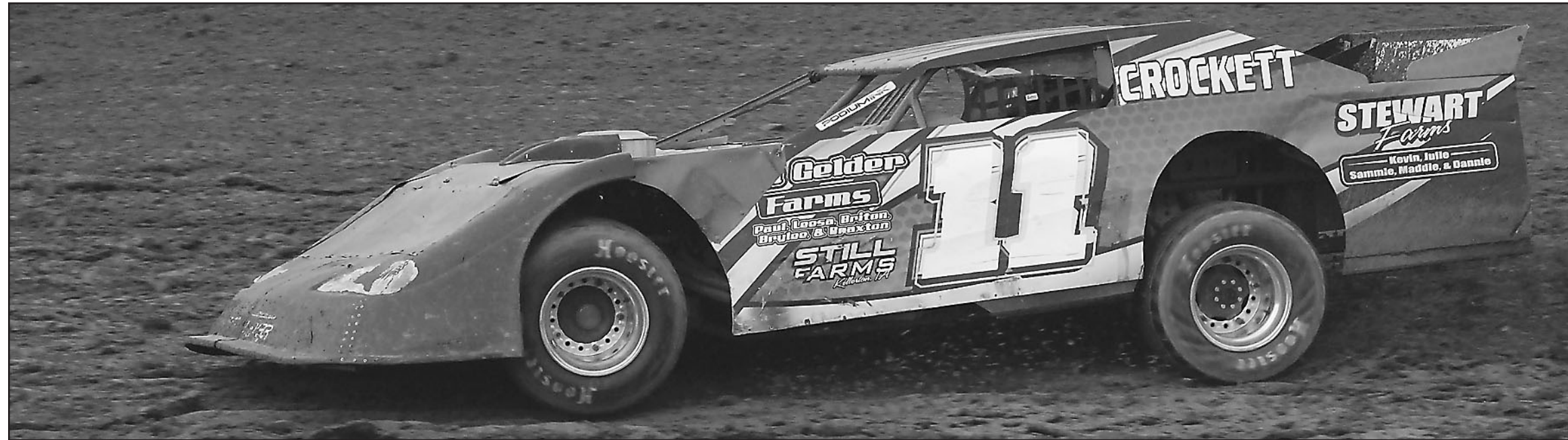
Brad Vogt (11) led 17 laps to win his first feature at the track last week.