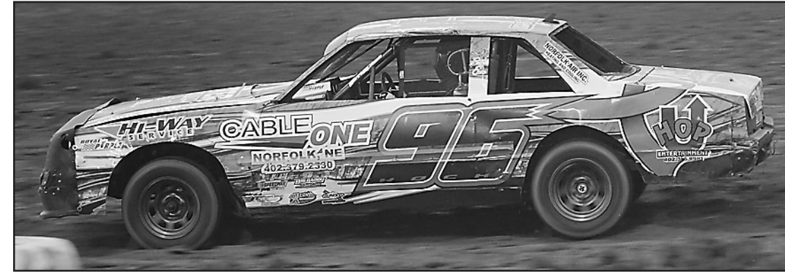
Gage Koch (96) finished seventh in the feature last week.