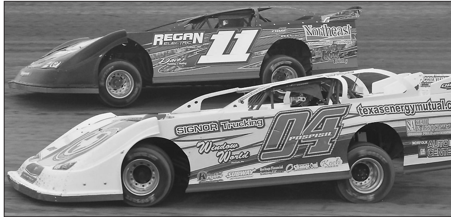
Tad Pospisil (04) passes Brad Vogt (11) during the first of two features.