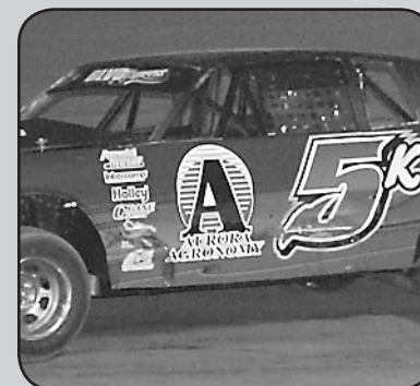
Stock Car winner Kyle Prauner