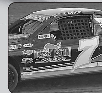
Sport Compact winner Lance Mielke