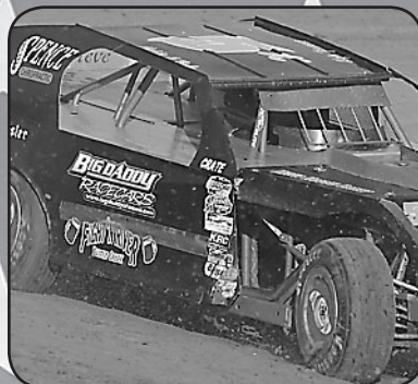
SportMods winner Kyle Prauner