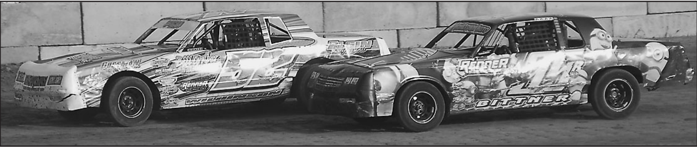
Tiffany Bittner (95B) took her fourth top 5 finish when she finished second in the feature.