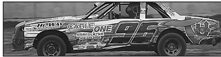
Gage Koch (96) took his second top 5 of the season.